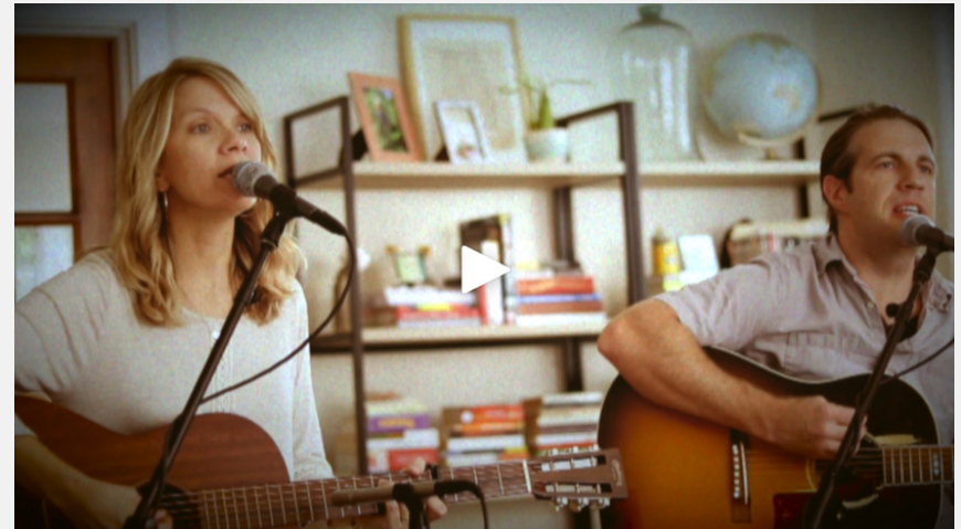
"God Who Sees Me" (Acoustic)