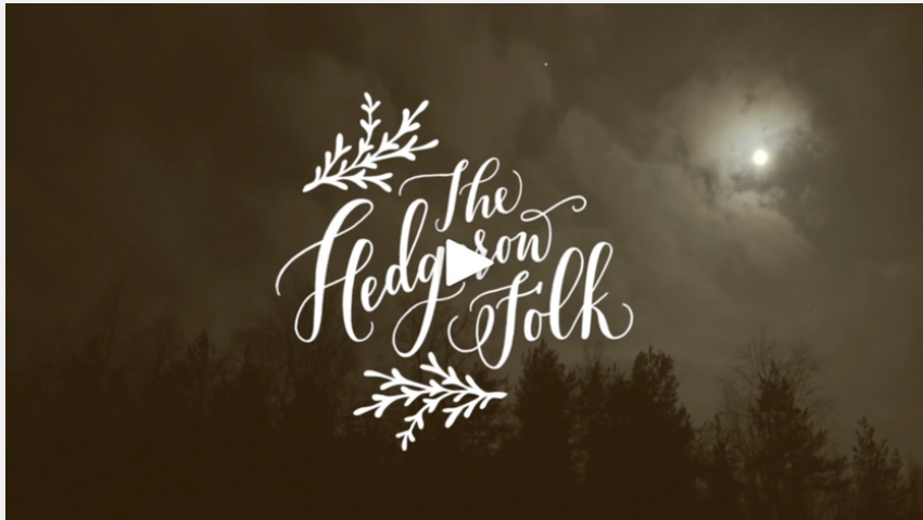
"God Who Sees Me" Lyric Video