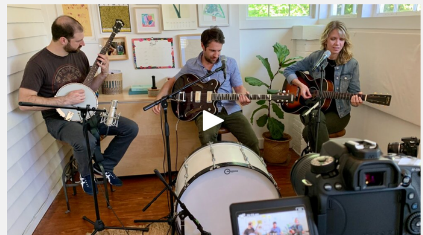
"Never a Day" (Acoustic)